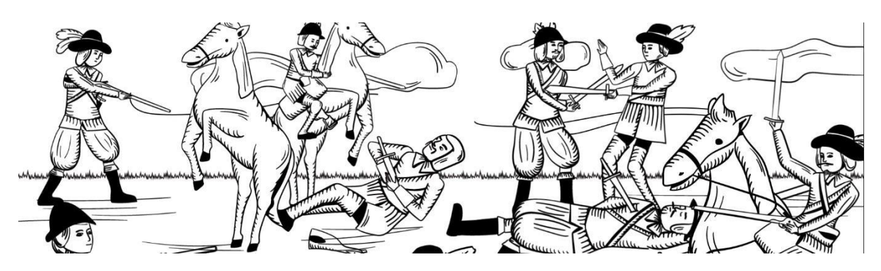
Watch the <u>film</u> and answer these questions